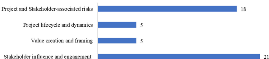
Fig. 4. Number of studies classified by theme

The content of the papers was analysed to identify how the essential elements and dimensions of stakeholder dynamics in a project environment were described. Based on this work it was possible to classify the studies of the 49 articles under four themes. Fig. 4 shows the classification of findings by theme of which 21 are related to stakeholder influence and engagement, followed by 5 on value creation and framing. A further 5 studies are on project lifecycle and dynamics, with 18 studies, on project risk management and stakeholder-associated risks.