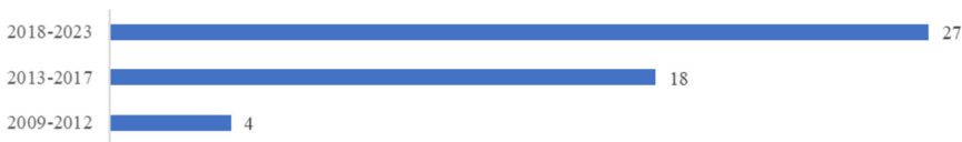
Fig. 2. Number of publications by period

For the descriptive analyses, categories that defined the 49 articles were selected by year of publication, method, and theme. Fig. 2 shows the number of articles by publication period. The publication periods were divided into 5-year periods, and it is noted that there is an increasing trend in the number of publications, indicating a growing research interest in this topic.