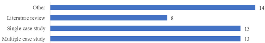
Fig. 3. Number of studies classified by method

Fig. 3 shows the methodology used in the studies of the 49 articles. Among the different methods adopted, most articles were case studies (13 single case studies and 13 multiple case studies), followed by 8 literature review articles. The rest of the articles included surveys, experiments discursive analysis, and interviews. It is noted that most of the studies are single or multiple case studies in various sectors with infrastructure being the highest.