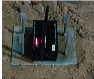
Fig. 1. Photo of wireless unit

A road was selected, and the pavement was paved with recycled cement concrete and conventional cement concrete respectively. The measurement was made with the wireless units that contained accelerometer measuring vibration in the vertical direction with the sampling frequency of 512 Hz, as shown in Fig. 1. The vehicle-induced vibration of the two kinds of pavement was tested, and the dynamic performance of the two kinds of cement concrete pavement was compared, as shown in Fig. 2.