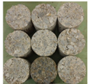
c) Static mixing