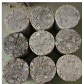
b) Vibration machine off-vibration mixing