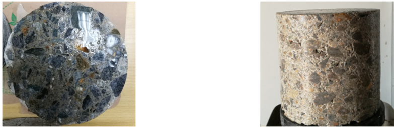
Fig. 1. The cross-sectional structure of the specimen