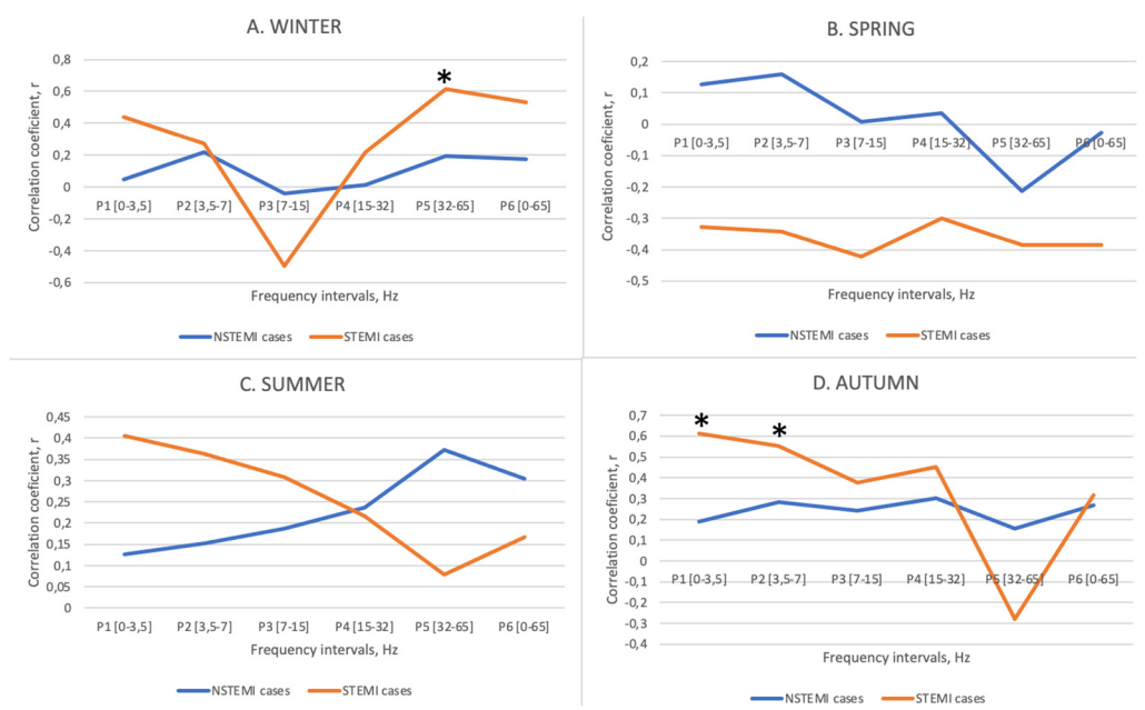
Fig. 3. Correlation between LDL in STEMI and NSTEMI groups with geomagnetic field strength in different frequency ranges during seasons in 2019 (A – Winter; B – Spring; C – Summer; D – Autumn; * – p < 0.05)

local Earth's magnetic field range. However, there was no significant correlation with NSTEMI. In addition, a positive correlation between changes in acute coronary syndrome and local Earth's magnetic field intensity in the high frequency range 32-65 Hz in the male group during the winter season was observed, whereas in previous studies, it was observed in the female group [2, 3]. No significant association of TnI with magnetic fields was observed in this study, as reported in previous studies [3]. This may be due to the fact that the magnitude of TnI depends on the onset of symptoms and the timing of blood sampling, which varies between cases. It is therefore very difficult to draw general conclusions as many of the individual characteristics that lead to different relationships with the surrounding environment are unknown.