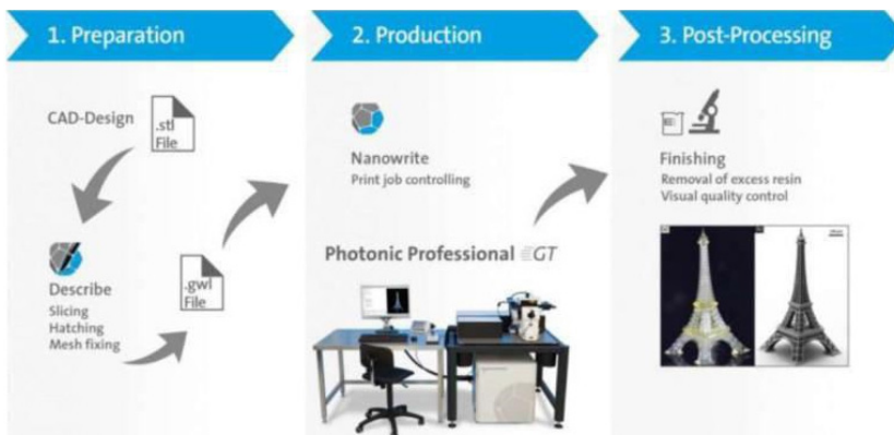
Fig. 1. Additive manufacturing process [8-12]

In additive manufacturing, the preparation of the product is the same as the traditional method. The product is created by software. However, production can be realized in a very advantageous way by creating a design and producing the product, disparate from the traditional method [8-12] (Fig. 1).