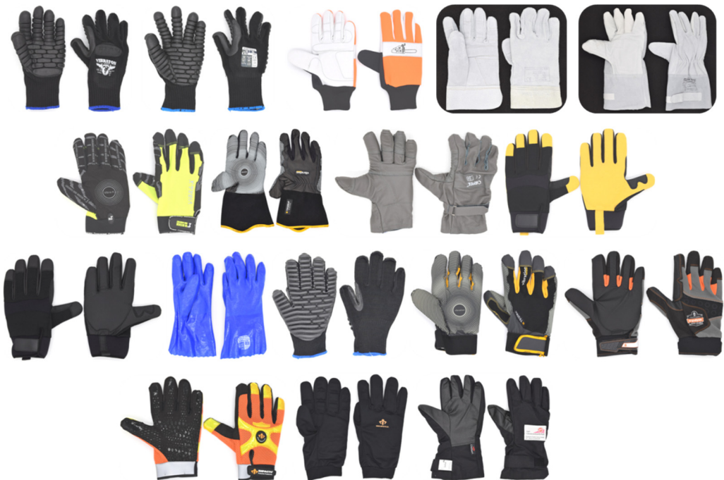
Fig. 1. Tested gloves

Due to the interests of manufacturers, the article uses the numbers assigned to them for testing purposes instead of the names of the gloves. There are also illustrative photos that do not allow for unequivocal identification of the presented products.