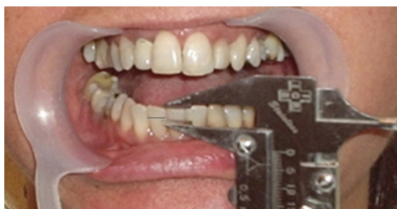
Fig. 1. Overbite measurement

obtained. For measuring the overbite analog calipers were used. (Fig. 1).