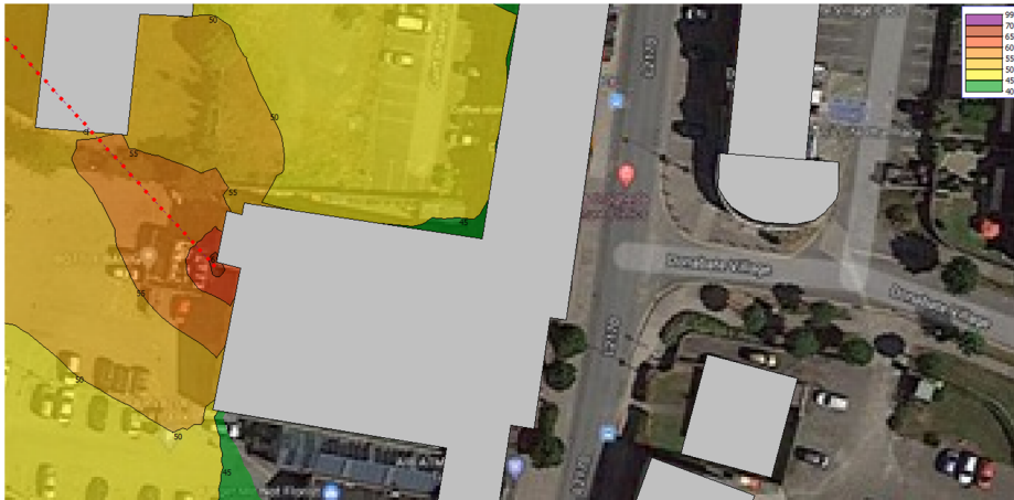
Fig. 3. FP2, velocity 1 Km/Hr, 200 daytime flights