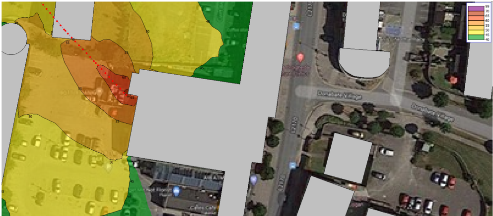
Fig. 2. FP3, velocity 1 Km/Hr, 150 daytime flights