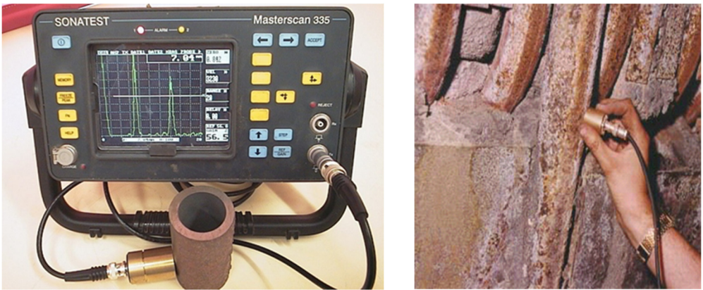
Fig. 1. EMAT transducer coupled with a popular standard UT instrument MS335 (left) and the manual EMAT thickness measurement performed on boiler tubes (right)

The experiments were done in laboratory using real tube samples obtained from power plants in Kazakhstan. These samples were exposed to real life conditions in boilers. The high temperatures, over 400-450 °C in the boiler causes the reaction between steel tube material and steam and flue gas producing hard, adhering scale with high contents of iron oxides. The scale is first produced on tube external surface, directly exposed to the flame, where temperatures are highest. For the purpose of obtaining magnetostrictive coupling between EMAT transducer and the tube it is not, however critical where the scale is located. Good indications were obtained with scale on either surface while testing from the outside. More important than location is the chemical composition of the scale, determining its magnetostrictive properties and its adherence to the parent metal. The scale thickness, even so emphasized in many previous publications was found not to be that important as authors were able to obtain good EMAT indications through scale ranging from less than few microns to 7 mm thick [7]. Figure 1 shows the EMAT transducer coupled with a standard off-shelf UT equipment and how the manual inspection is done on boiler tubes.