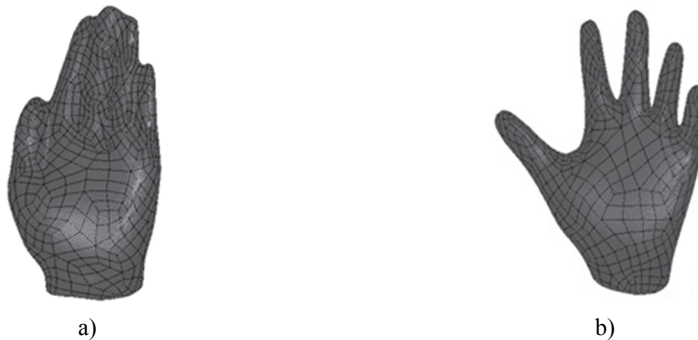
Fig. 1. Hand model with a) closed fingers, b) separated fingers

The left hand of an international level female swimmer was scanned with 3D scanner Artec L. Two nodal 3D models of hand with closed and with separated fingers were created and transferred to the surfacing software Leios2 to optimize and transform the point cloud into a complete 3D polygon models (Fig. 1).