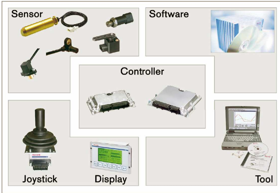
Fig.1. Microelectronic control system BODAS [1]

color display, with a full customization of the interface. It supports the connection of a camera for the operator to observe the work area of the machine. All devices can be connected to the controller, process input signals and control selected mechanical as well as hydraulic components of the drive system.